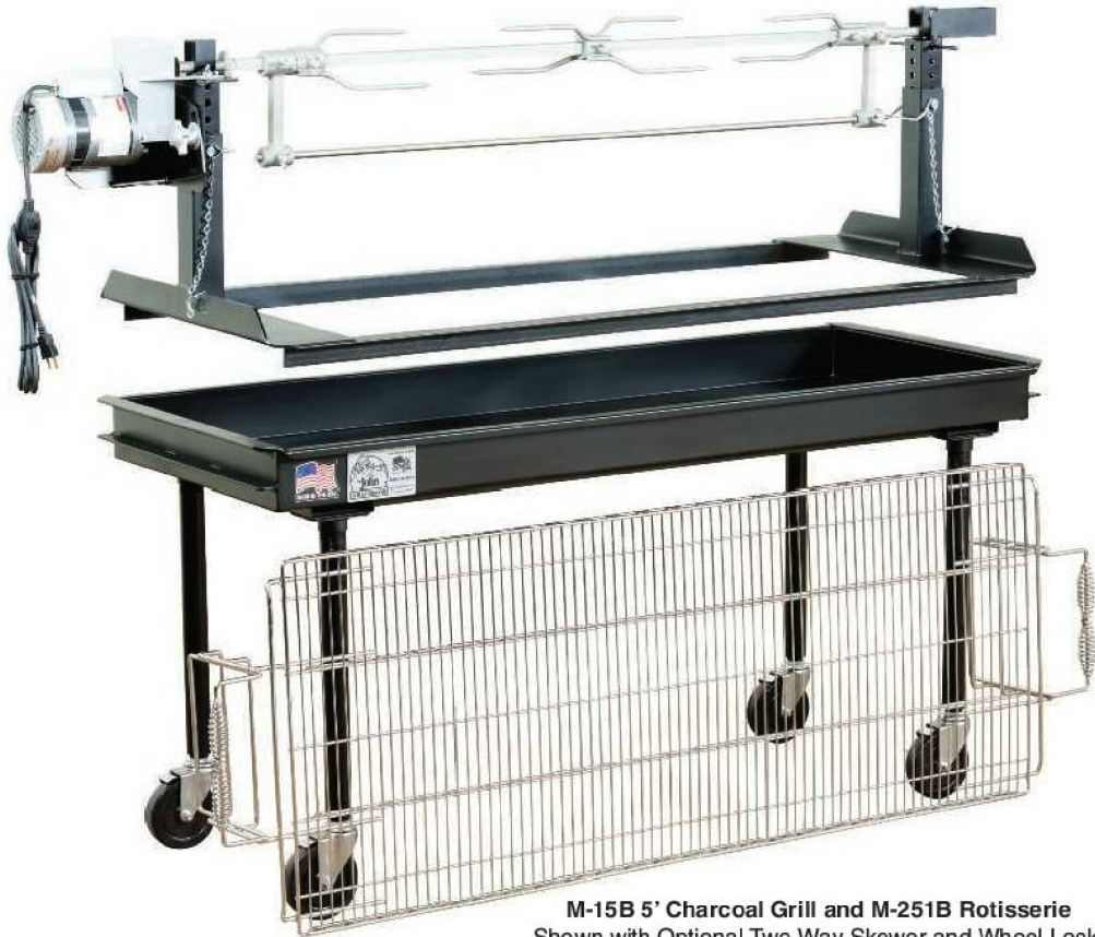
M-15B 5' Charcoal Grill and M-251B Rotisserie Shown with Optional Two Way Skewer and Wheel Locks