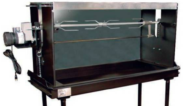
OV-5B Oven shown with front panel removed