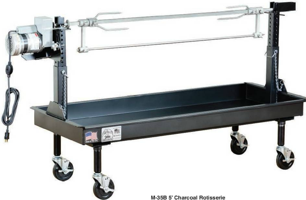
M-35B 5' Charcoal Rotisserie Shown with Optional Wheel Locks