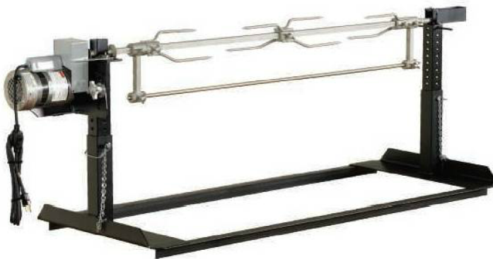
M-251B 5' Add-On Rotisserie Shown with Optional Two Way Skewer